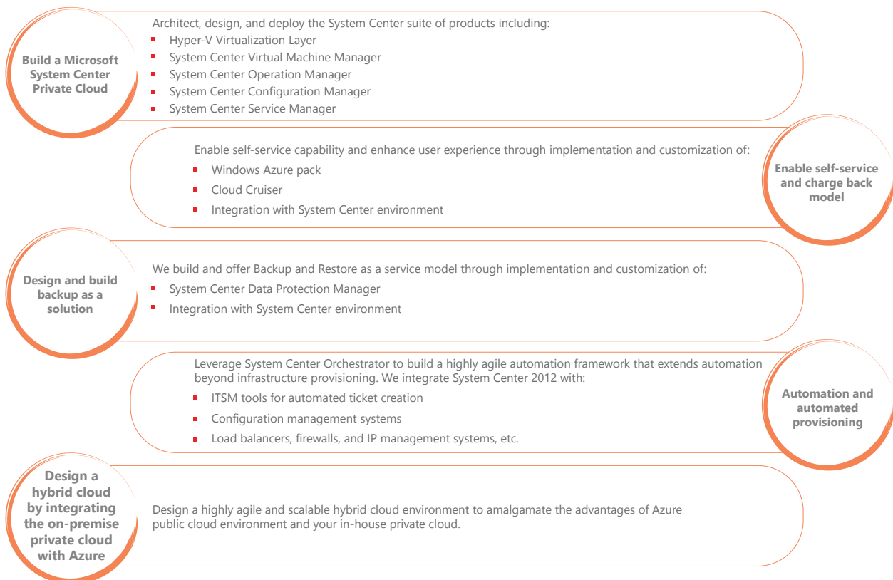
Figure 1: Microland's Microsoft System Center Integrated Service Offerings

simplify management of your cloud environment by leveraging Microsoft System Center suite of products.